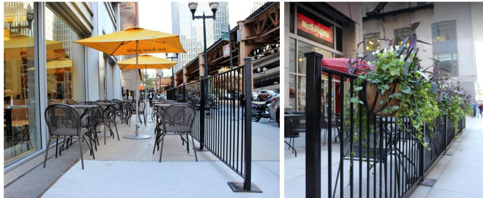
Figure 1: Sample materials.