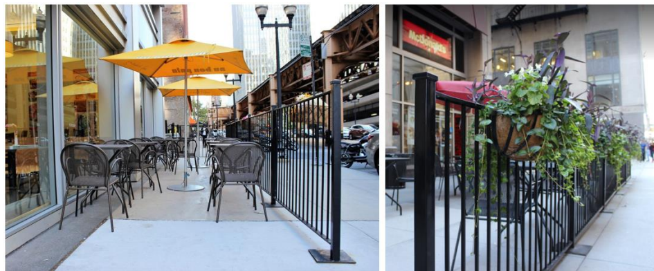
Figure 1: Sample materials.