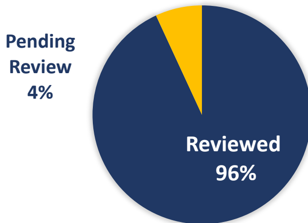
Figure 2 illustrates the 82 allegations logged from the 35 cases reviewed by the Commission.

Below, Figure 1 identifies the cases reviewed in 2022 vs. the cases remaining for the Commission's review by the end of 2022.