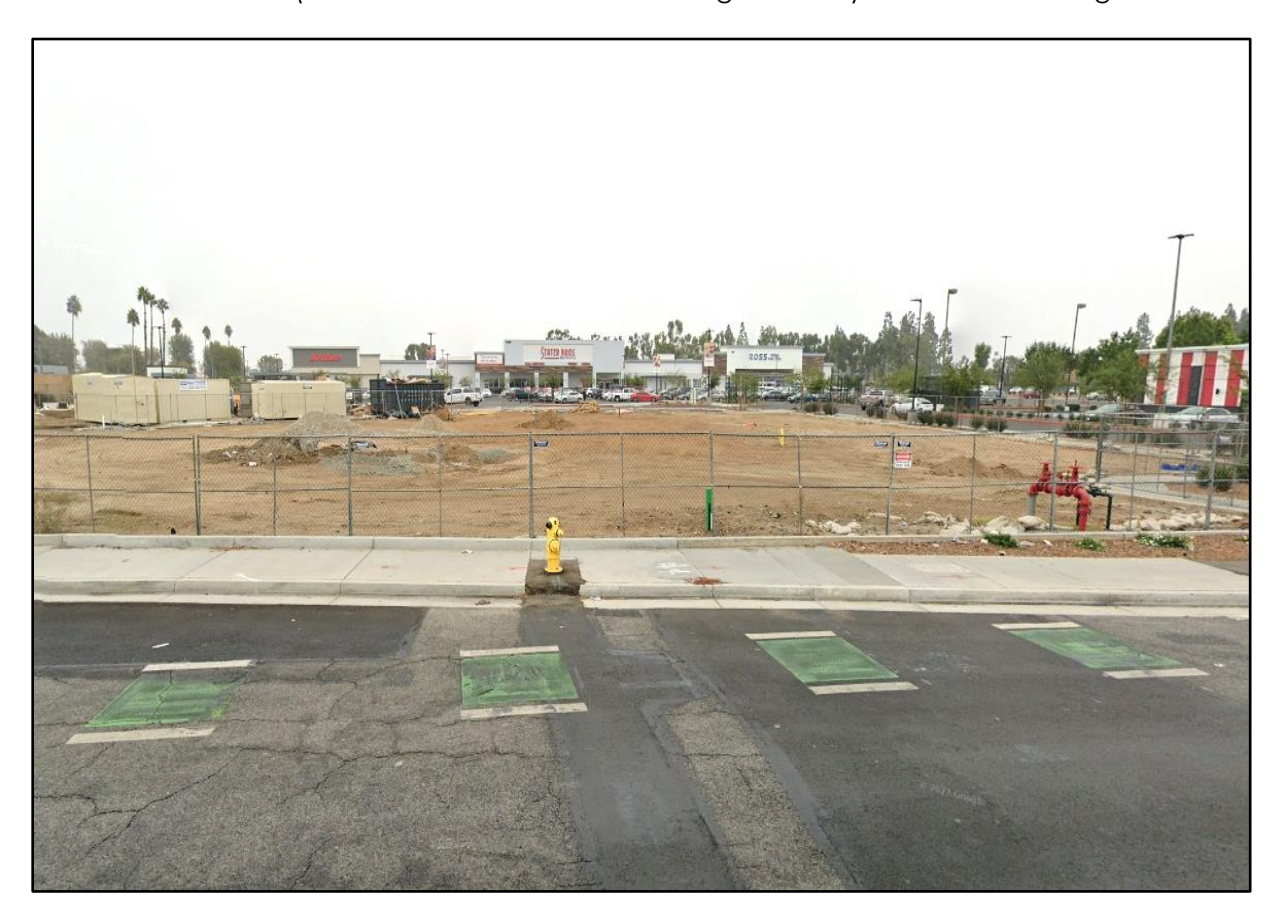
Street View from Van Buren Boulevard