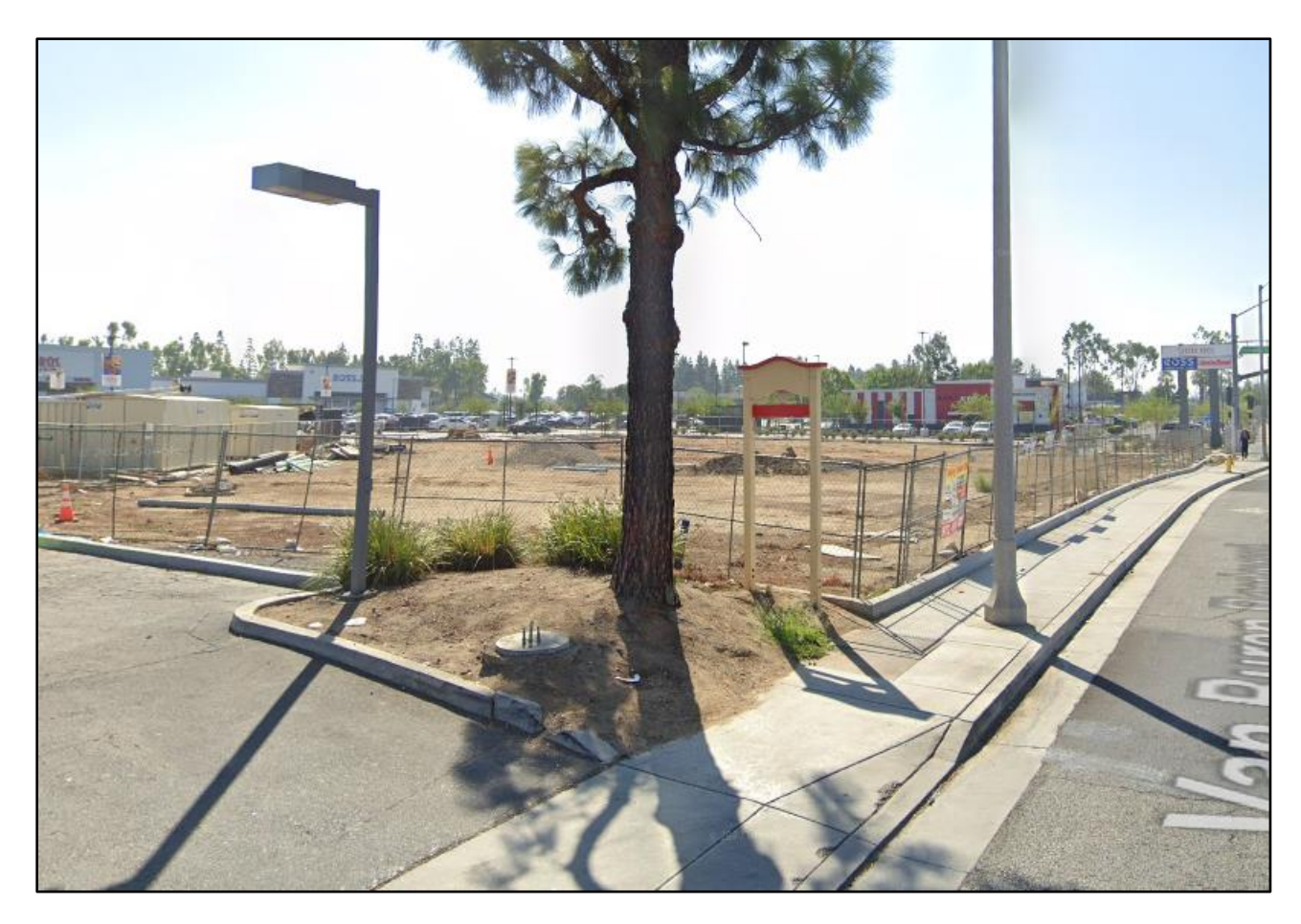
View looking southeast towards the Project site