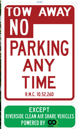
Proposed Signs (Initial Draft)