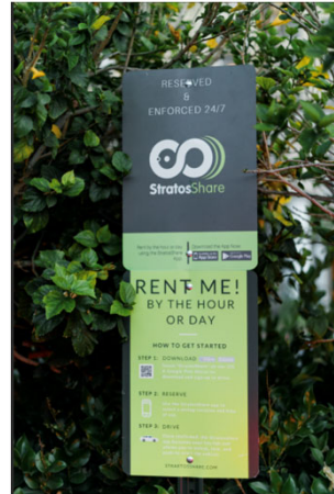
Existing location Signs