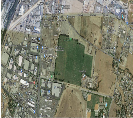
AB Brown Sports Complex