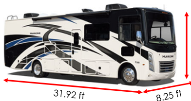
Image source: Thor Motor Coach, Class A Motorhome GVWR: 18,000 pounds