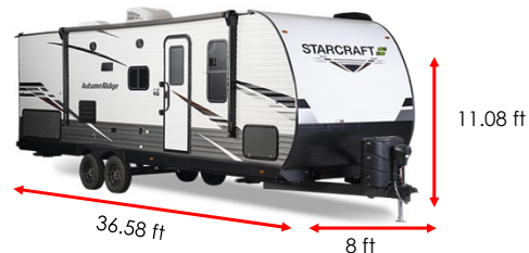
Image source: Starcraft RV, Travel Trailer, Autumn Ridge GVWR: 7,430 pounds