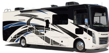
Image source: Thor Motor Coach, Class A Motorhome GVWR: 18,000 pounds