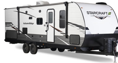
Image source: Starcraft RV, Travel Trailer, Autumn Ridge GVWR: 7,430 pounds