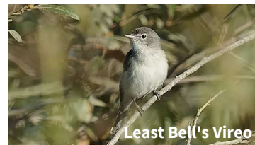
Least Bell's Vireo

Construction and maintenance work in riparian areas need to go through regulatory permitting processes. Work must be monitored by a qualified biologist to ensure there are no impacts to riparian resources.