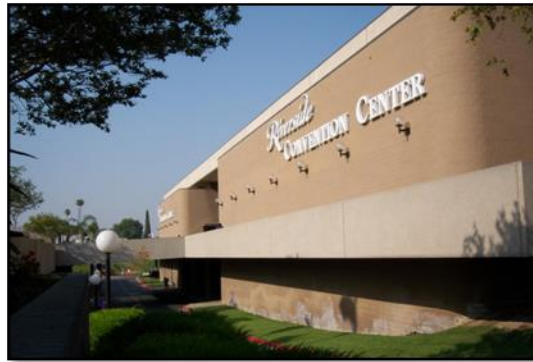
CONVENTION CENTER (NOW)