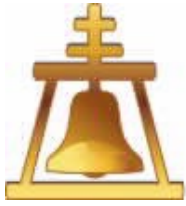
EXHIBIT 2 – STAFF RECOMMENDED CONDITIONS OF APPROVAL