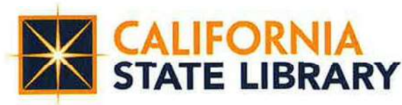
EXHIBIT C: CALIFORNIA LIBRARY LITERACY SERVICES GUIDELINES