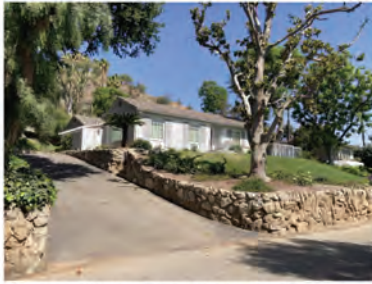
13. NEIGHBORING PROPERTY - 3875 MT. RUBIDOUX DR. - FRONT VIEW