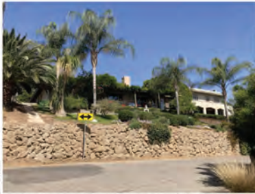
9. NEIGHBORING PROPERTY - 3801 MT. RUBIDOUX DR. FRONT VIEW