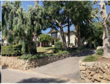
14. NEIGHBORING PROPERTY - 4617 9TH ST. - FRONT VIEW