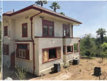
4. SOUTH PERSPECTIVE VIEW - SIDE ELEVATION - MAIN HOUSE