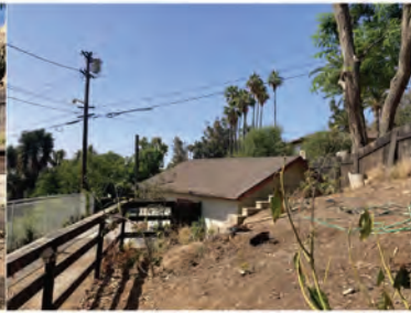
7. NORTHEAST PERSPECTIVE VIEW FRONT ELEVATION DETACHED GARAGE NOT APART OF PROJECT (N.A.P.)