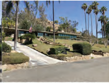
16. NEIGHBORING PROPERTY - 3881 LORING DR. - FRONT VIEW