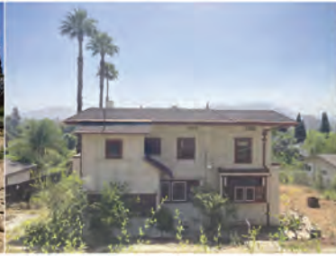
2. WEST VIEW - REAR ELEVATION - MAIN HOUSE