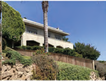
8. NEIGHBORING PROPERTY - 3783 MT. RUBIDOUX DR. - FRONT VIEW