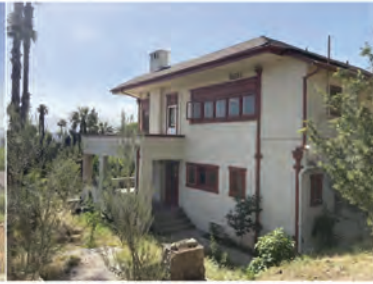
3. NORTH PERSPECTIVE VIEW - SIDE ELEVATION - MAIN HOUSE