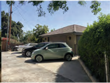
10. NEIGHBORING PROPERTY - 3801 MT. RUBIDOUX DR. - REAR VIEW VIA LORING DR.