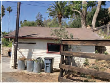
6. EAST PERSPECTIVE VIEW - FRONT ELEVATION - DETACHED GARAGE NOT APART OF PROJECT (N.A.P.)