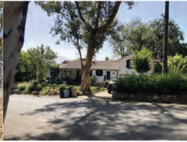
15. NEIGHBORING PROPERTY - 4640 9TH ST. - FRONT VIEW