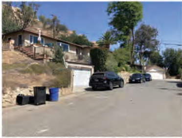
17. NEIGHBORING PROPERTY - 3849 LORING DR. - FRONT VIEW