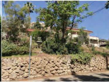
11. NEIGHBORING PROPERTY - 3847 MT. RUBIDOUX DR. - FRONT VIEW