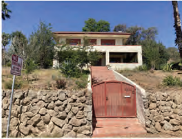
1. EAST VIEW - FRONT ELEVATION - MAIN HOUSE