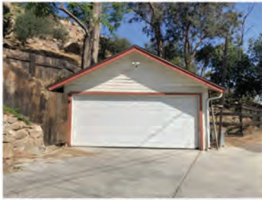
5. SOUTH PERSPECTIVE VIEW - FRONT ELEVATION - DETACHED GARAGE NOT APART OF PROJECT (N.A.P.)