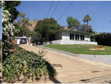
12. NEIGHBORING PROPERTY - 3859 MT. RUBIDOUX DR. - FRONT VIEW