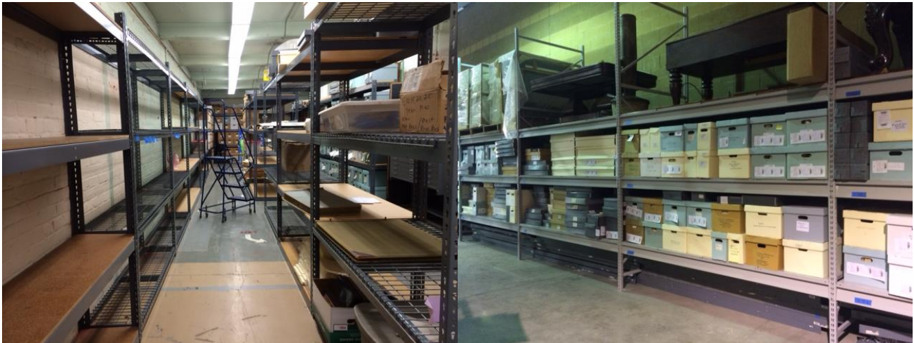
Museum Basement space where archives were

This has been completed. More than 1,000 boxes were moved. A staff report about the required move of the archives was presented at the September 13, 2017 Museum Board meeting.