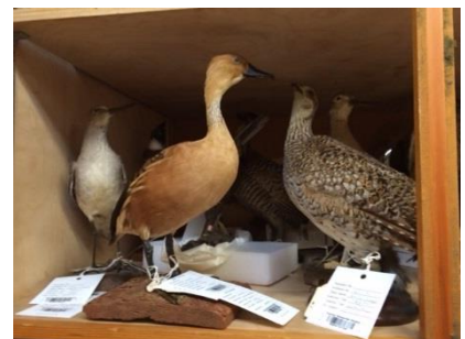
Samples of the Natural History Collection's taxidermy specimens