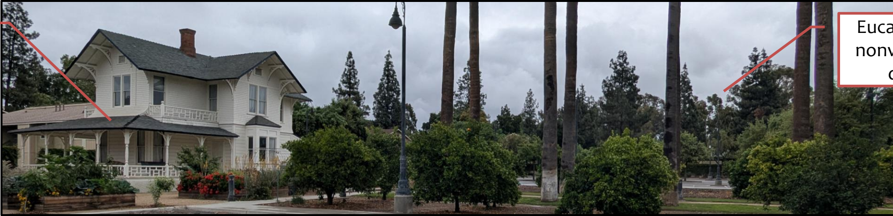
Eucalyptus tree, nonvisible in the distance