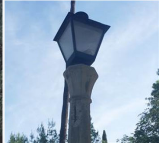
TOWN & COUNTRY TOP