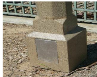
NEW KODIAK STANDARD