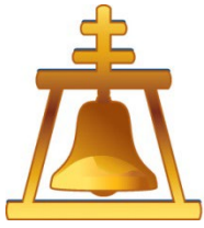
EXHIBIT 2 – STAFF RECOMMENDED CONDITIONS OF APPROVAL