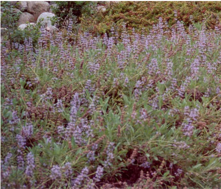
Salvia 'Mrs. Beard' MRS. BEARD SAGE