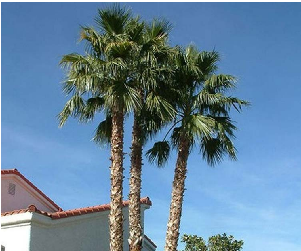
Washingtonia robusta MEXICAN FAN PALM