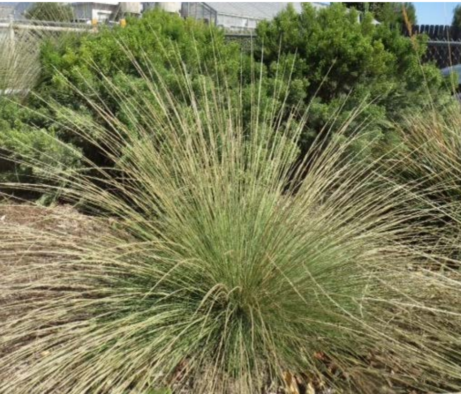
Muhlenbergia dubia PINE MUHLY