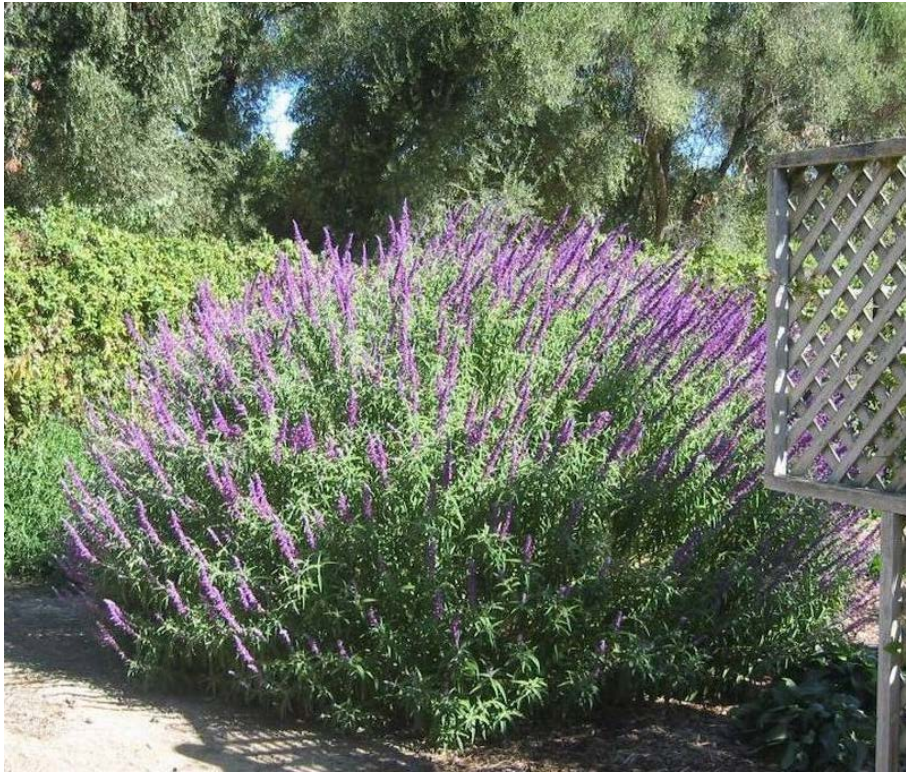
Salvia leucantha 'Santa Barbara' Santa Barbara Mexican Bush Sage