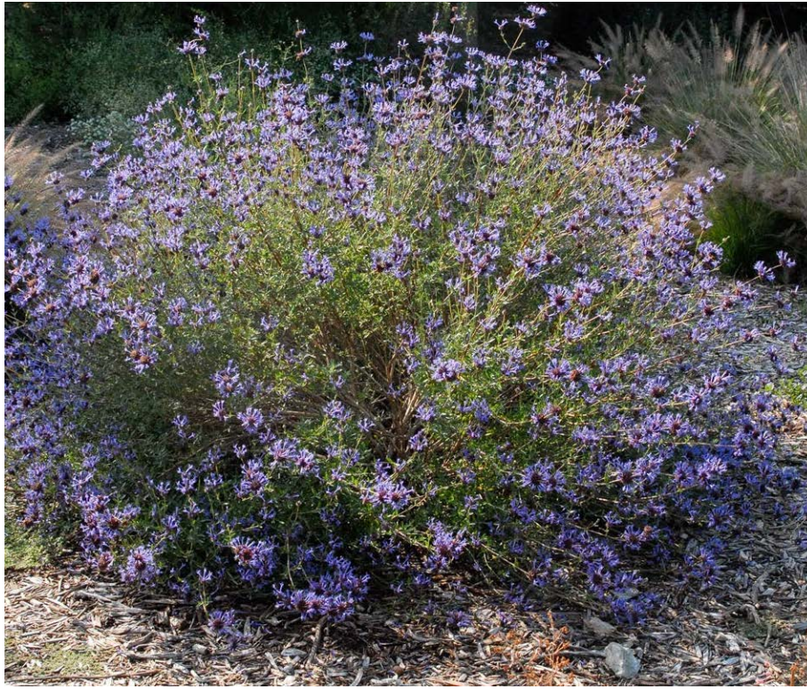
Salvia clevelandii CLEVELAND SAGE