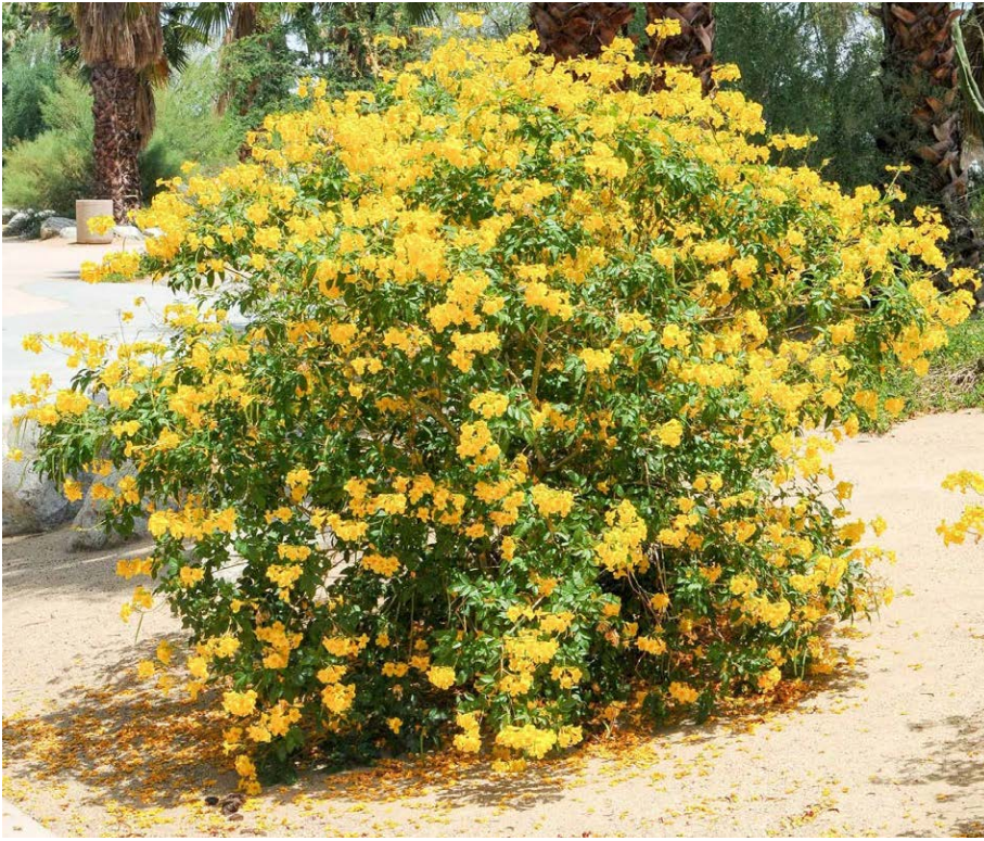
Tecoma stans var. stans 'Gold Star' 'GOLD STAR' YELLOW BELLS