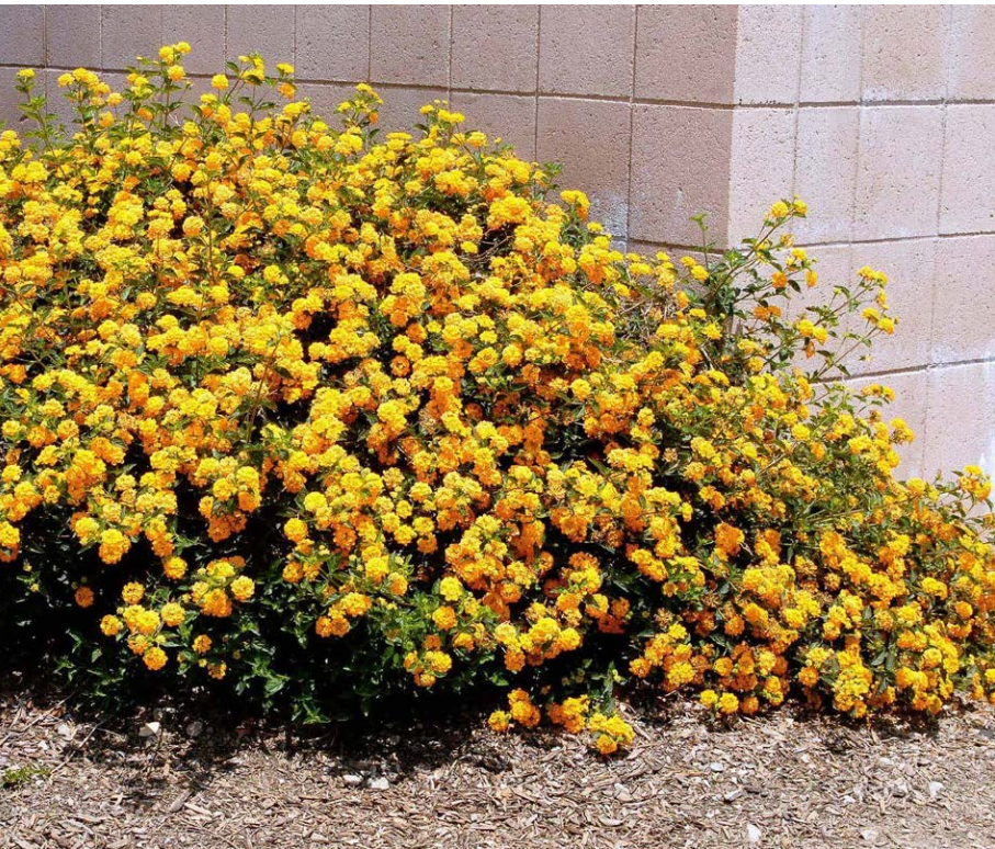
Lantana x 'New Gold' NEW GOLD LANTANA