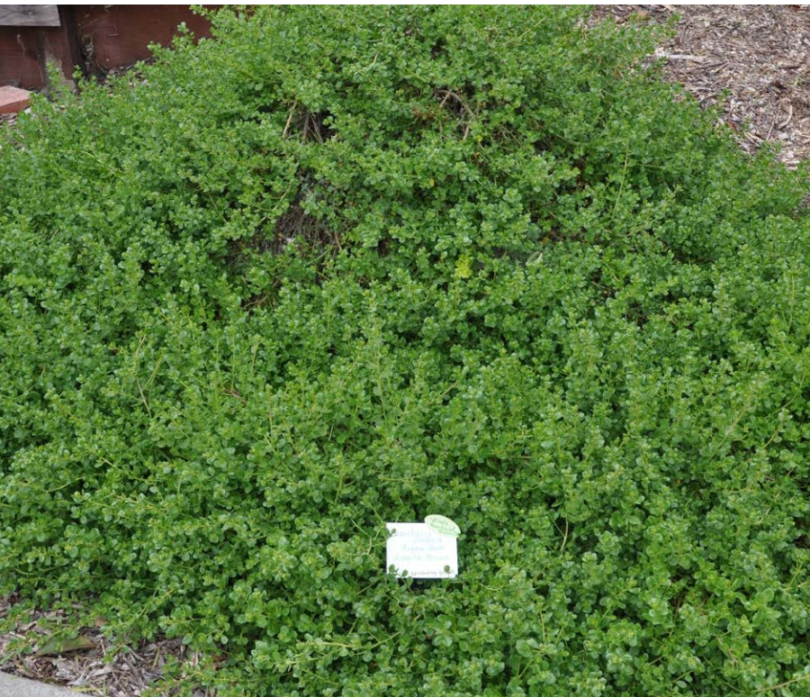
Baccharis pilularis 'Pigeon Point' PIGEON POINT COYOTE BRUSH