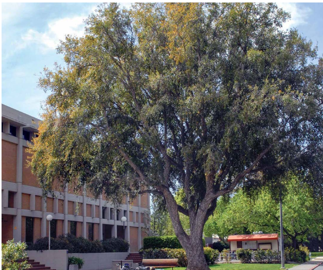
Quercus suber CORK OAK