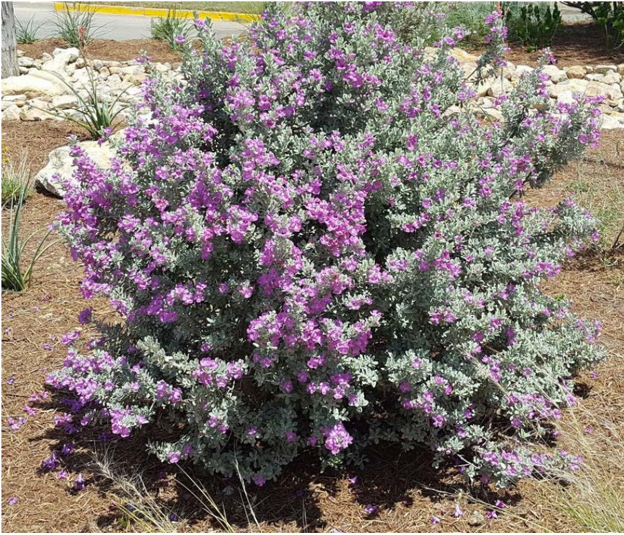
Leucophyllum frutescens TEXAS SAGE