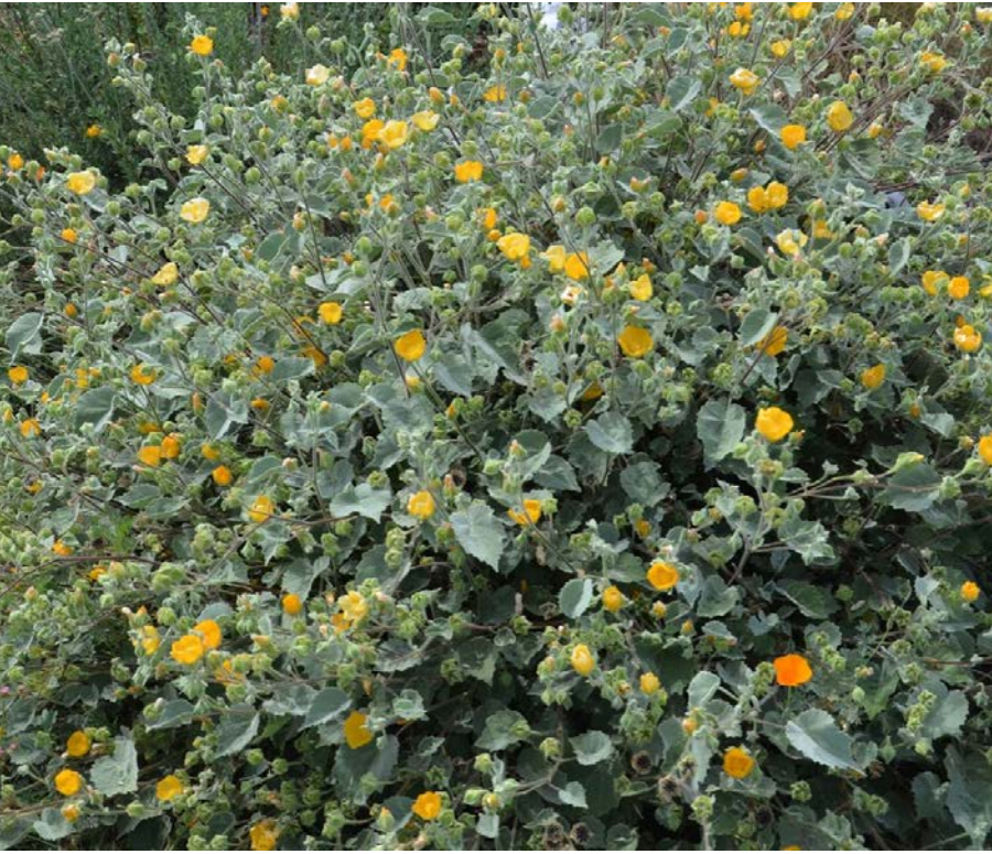
Abutilon palmeri INDIAN MALLOW