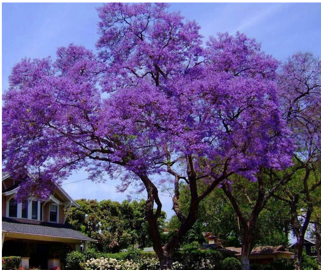
Jacaranda mimosifolia JACARANDA