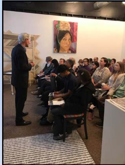
Staged reading of "Frost/Nixon"