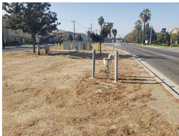
UTILITIES TO BE RELOCATED