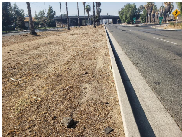
MEDIAN NEAR SR-91 RAMPS