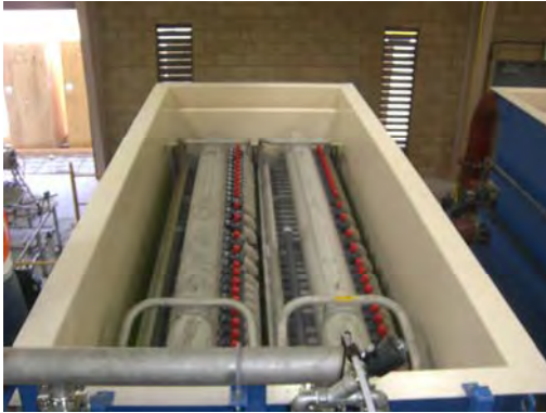
Two Cassettes within Basin