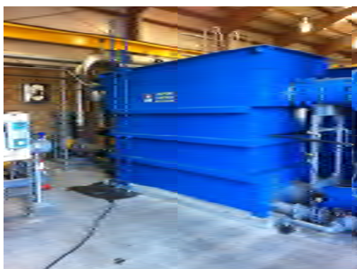
Ultrafiltration Basin (Train No.5) Cassette removal for inspection