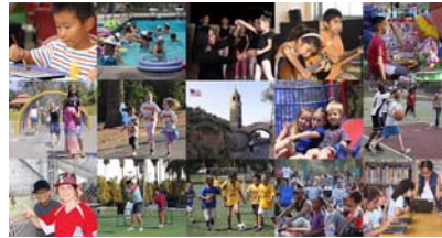
Parks Master Plan Vision 2030