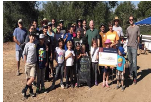
Castleview Arroyo Project

The RNP supports the formation of local neighborhood groups