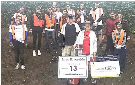
Neighbor 2 Neighbor La Sierra South