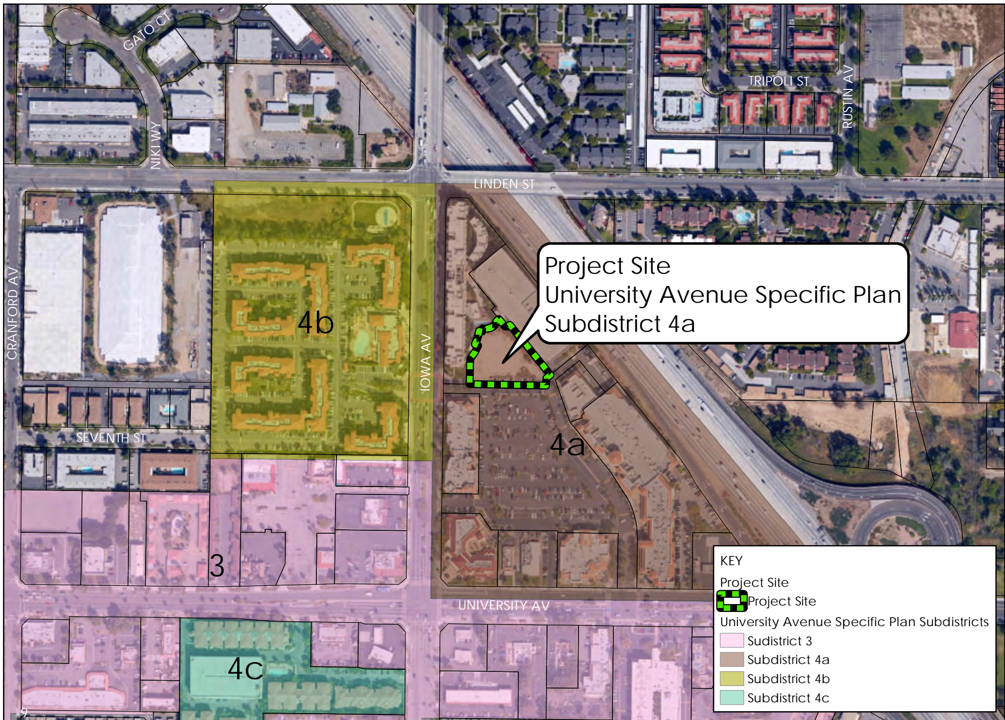
Exhibit 5 - University Avenue Specific Plan Subdistrict Map