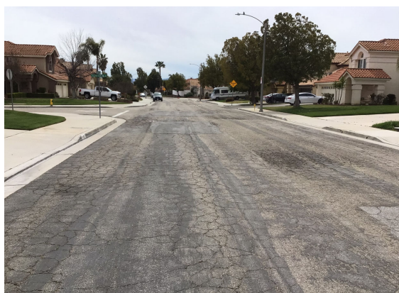
MESA OAK DRIVE