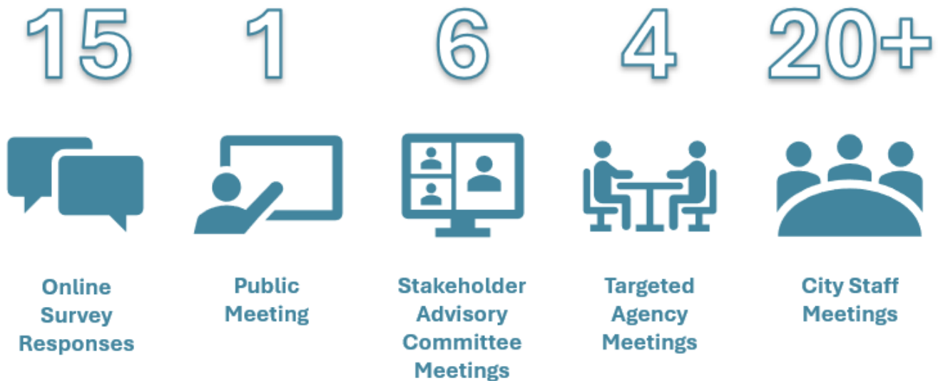
Figure 2: Comprehensive Community Engagement Summary

The comprehensive community engagement plans included multiple Stakeholder Advisory Committee (SAC) meetings, a public meeting, a developer’s only meeting, establishment of a website Riversidevmt.com , and an online survey. The SAC consists of local stakeholders including Western Riverside Council of governments (WRCOG), Riverside Transit Authority (RTA), County of Riverside, and University of California Riverside (UCR), etc.