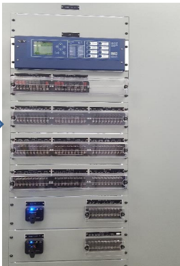
Modern Digital Relays