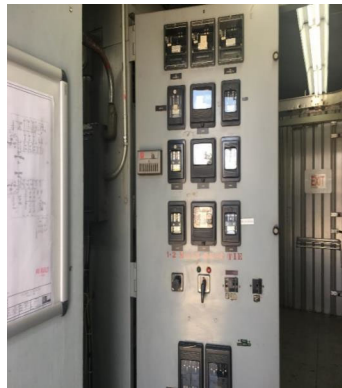
Typical Electromechanical Relays