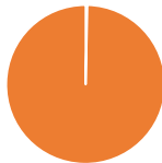
Load Origination - Commercial Waste

■ Commercial Waste: City (0.4%) ■ Commercial Waste: non-City (99.6%)