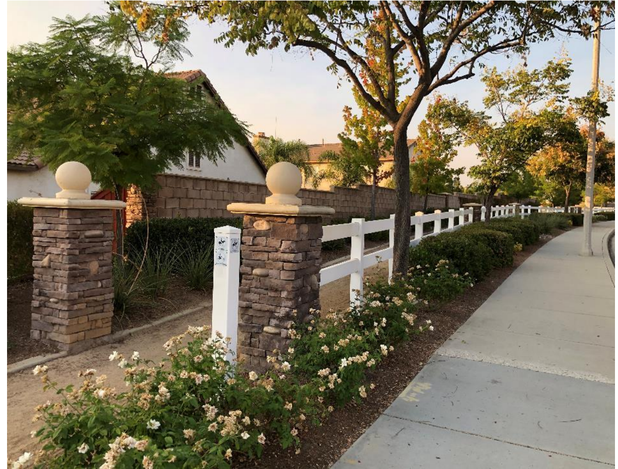
Bountiful Street Trail