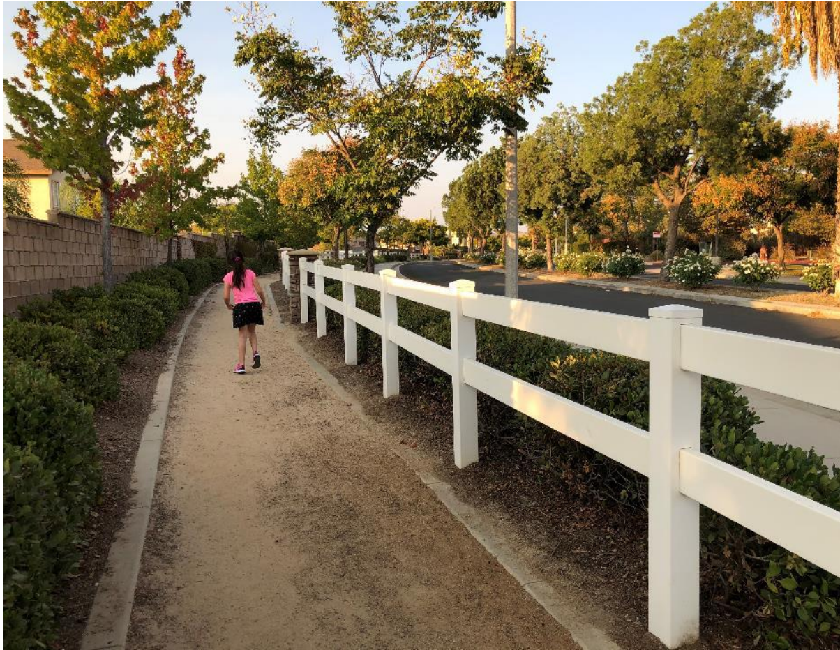
Bountiful Street Trail