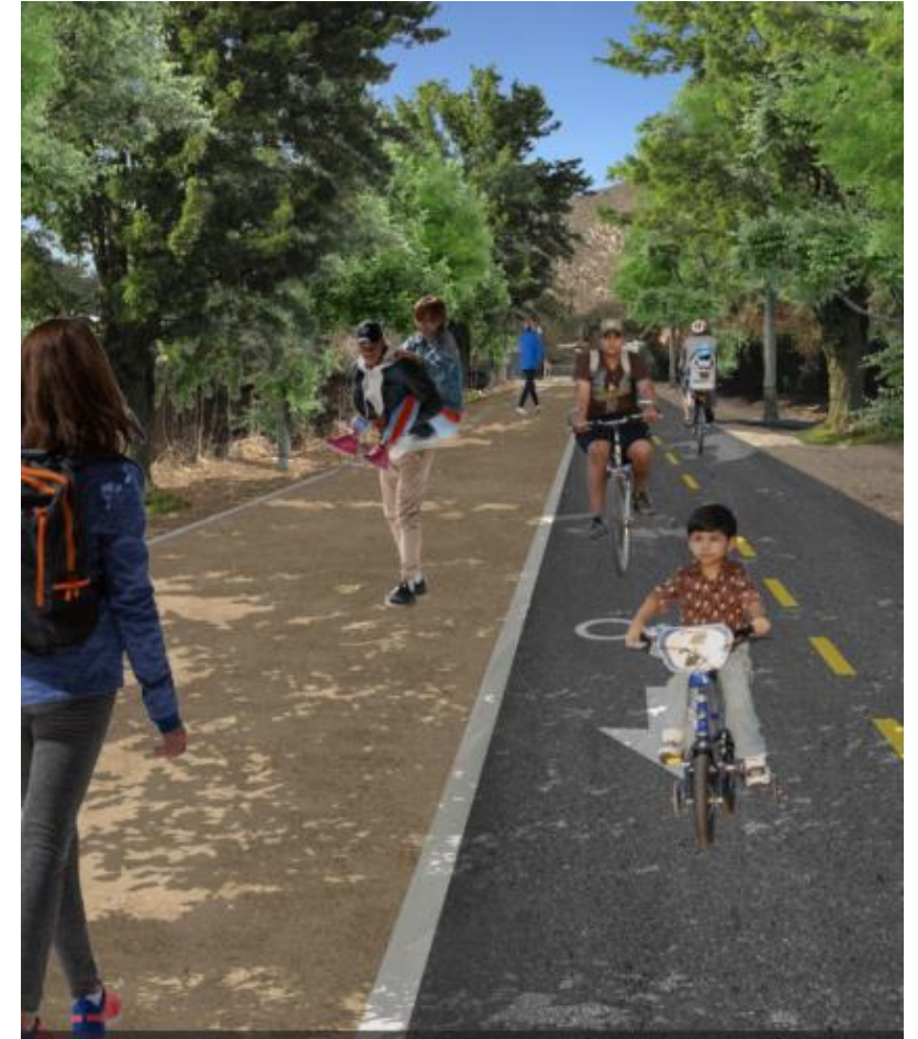
Gage Canal (between Palmyrita and Blaine coming soon)