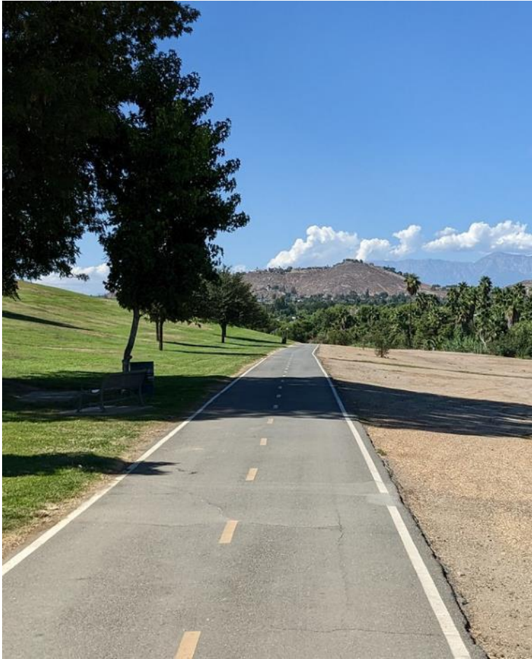
Santa Ana River Trail