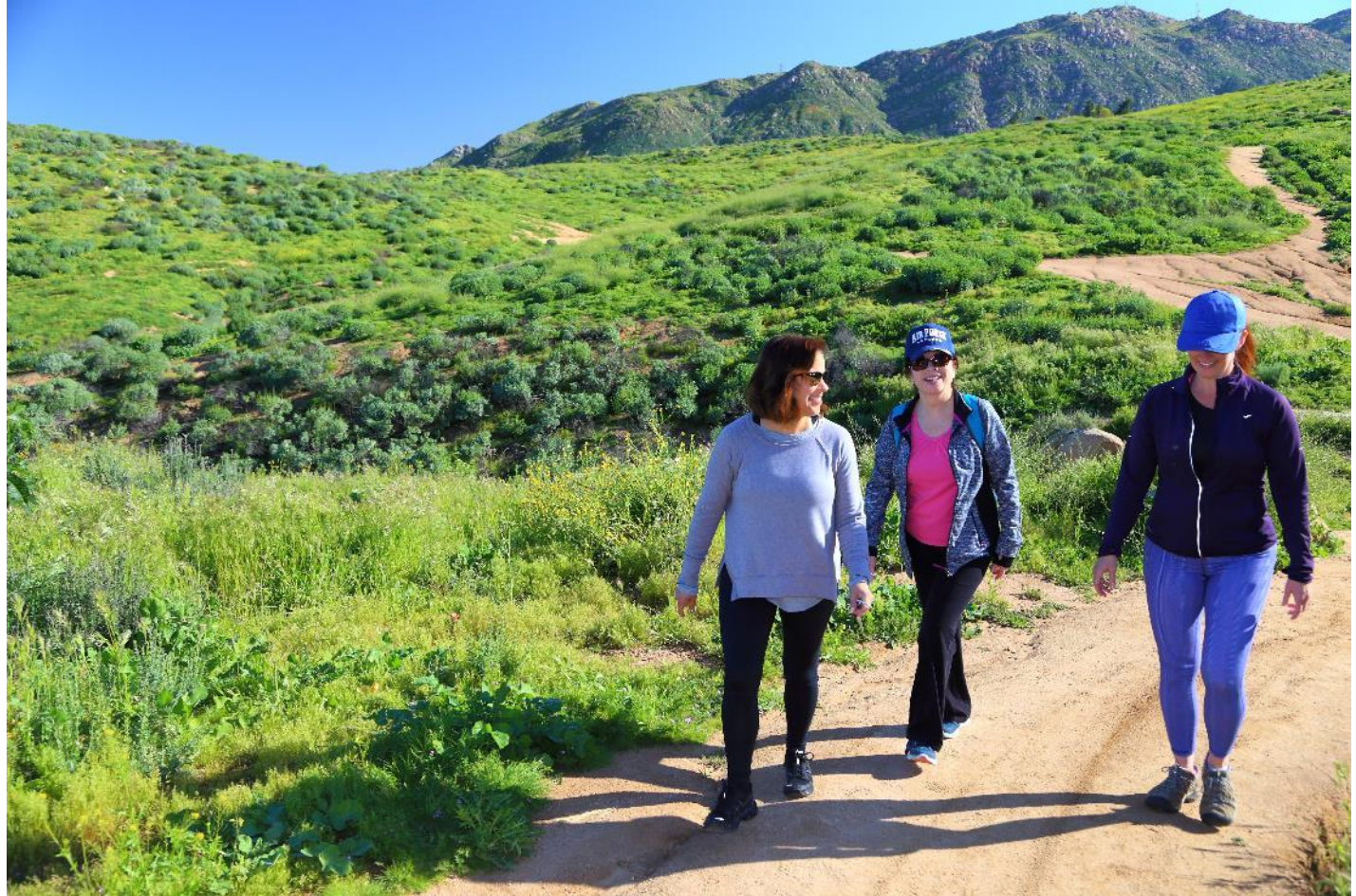
Sycamore Canyon Park