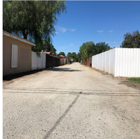
MEYERS/TAFT ALLEY @ PRIMEROSE 9