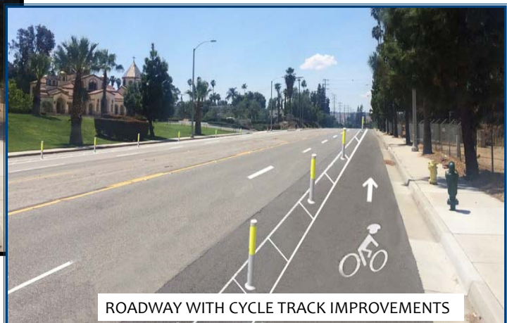
ROADWAY WITH CYCLE TRACK IMPROVEMENTS