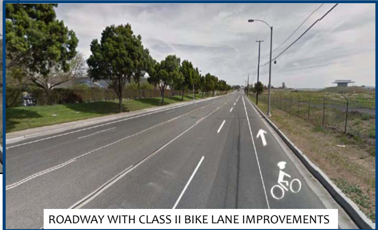
ROADWAY WITH CLASS II BIKE LANE IMPROVEMENTS