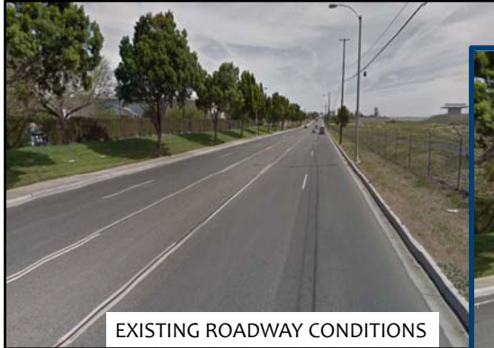
EXISTING ROADWAY CONDITIONS