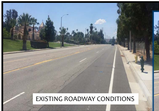
EXISTING ROADWAY CONDITIONS