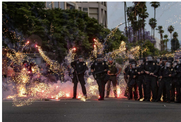
Riverside 2020 – Fireworks thrown at officers