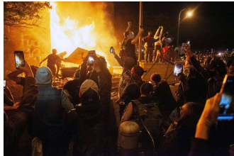
Minneapolis – participants all masked