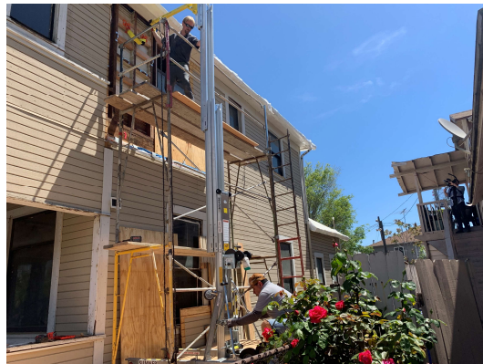
Video footage captured during removal of Harada House inscription wall, April 2024 – for use in documentary