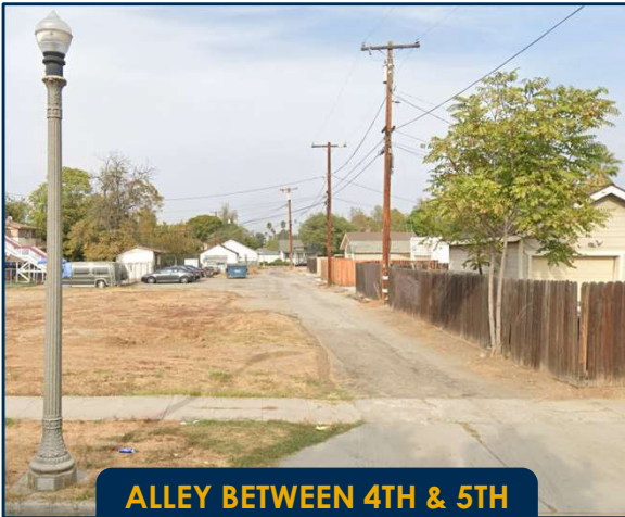
ALLEY BETWEEN 4TH & 5TH BETWEEN LIME & MULBERRY