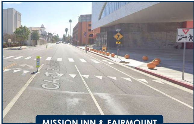
MISSION INN & FAIRMOUNT