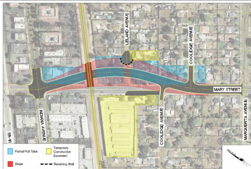
Mary Street Grade Separation – Alternative 2