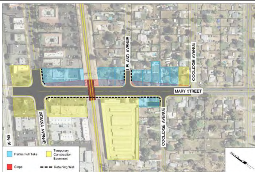
Mary Street Grade Separation – Alternative 1