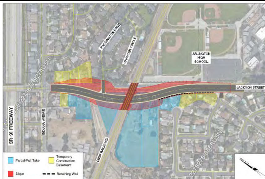
Jackson Street Grade Separation – Alternative 2