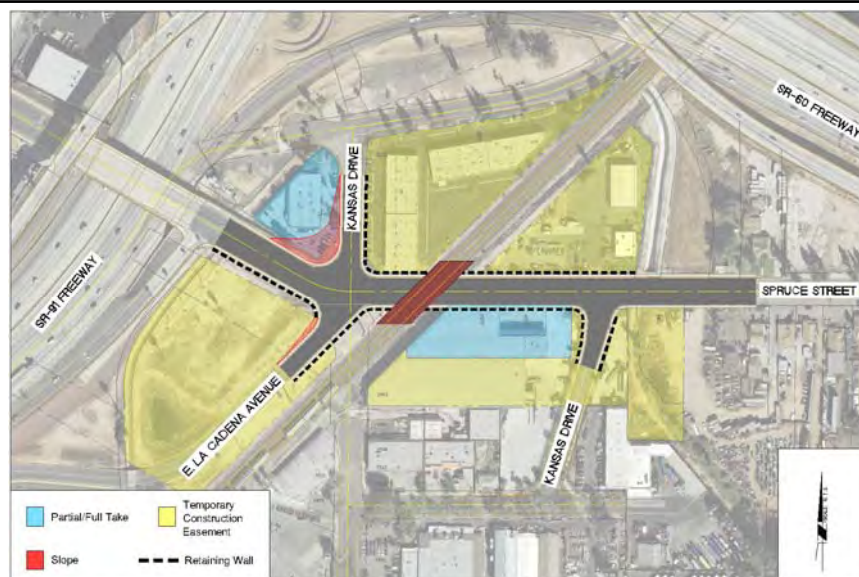
Spruce Street Grade Separation – Alternative 2