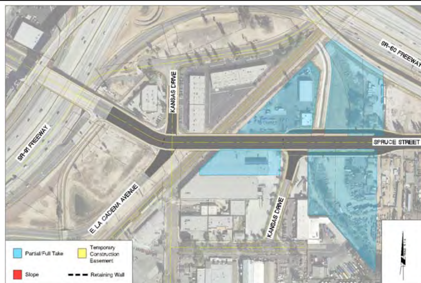
Spruce Street Grade Separation – Alternative 1