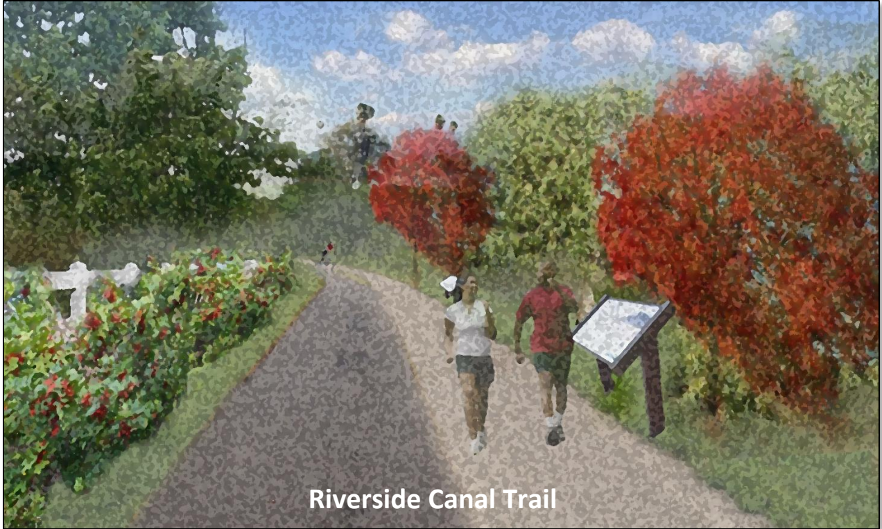
Riverside Canal Trail

Riverside Canal Trail: The Riverside Canal Trail preserves the historic decommissioned Riverside Canal (underground) and provides an urban trail to connect residences, workplaces, commercial centers, active transportation (bus stop at Nash and Orange Street intersection), and a neighborhood school.