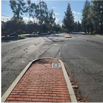
CANYON CREST DRIVE