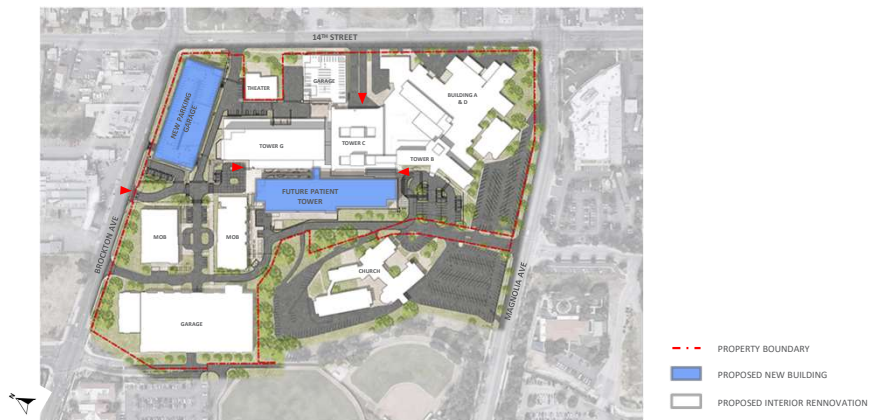
Riverside Community Hospital Proposed Site Plan