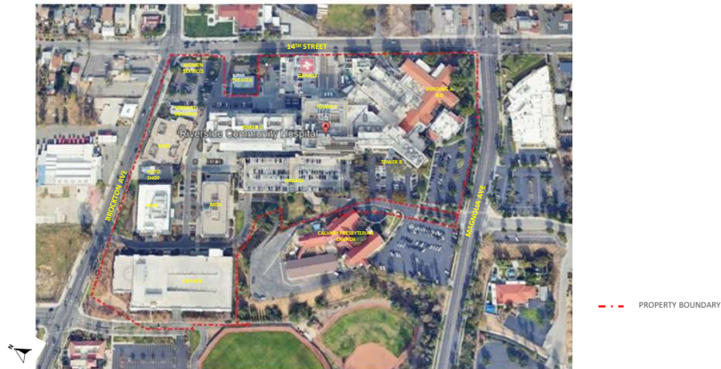
Riverside Community Hospital Existing Site Plan