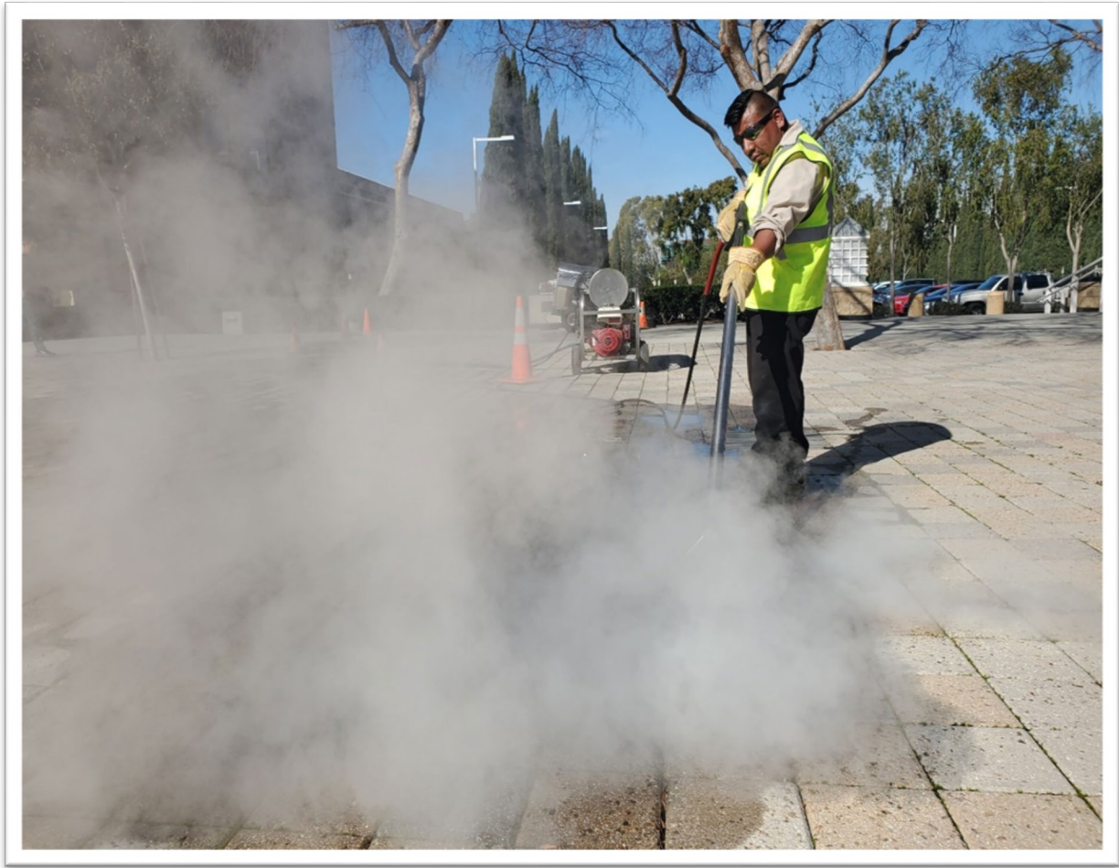
Example of a landscape contractor using steam to eradicate weeds in hardscapes.

The City is responsible for maintenance of 100 acres of fuel modification zones in the Village of Turtle Rock where goats were used for vegetation management. The use of goats demonstrates an alternate method to manage property without pesticides or contract labor. In 2021 during the pandemic, it was difficult to manage the goat's grazing in a safe manner due to the daily, heavily visited open space by the public. The goats became an attraction that led to many complaint calls from nearby residents due to the excessive traffic in their neighborhoods. In addition, a lack of normal rainfall led to reduced favorable vegetation for the goats to feed on. Therefore, staff had to employ flail mowing to properly finish the job for Orange County Fire Authority approval.