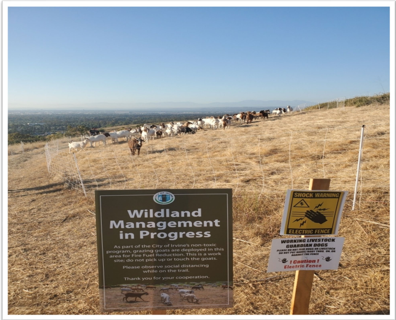
Example of goats performing weed abatement in the City's open space.

The Landscape Division also used biological control to reduce pest populations. Biological control uses organisms often referred to as beneficials, natural enemies, or biocontrols. The biological controls act to keep pest populations low enough to prevent significant economic damage. The most common organism types used for biological control in landscapes to combat pest populations are predators and parasites. In 2021, nearly 700,000 beneficial insects were released in the parks and streetscapes to combat destructive pests, instead of relying on pesticides.