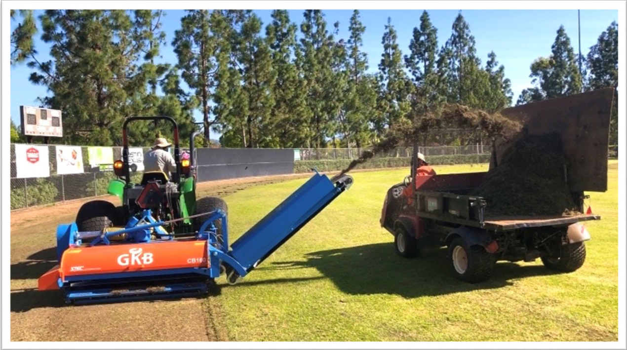
Example of Fraze mowing operation

Other non-pesticide weed control measures include applying three inches of mulch in landscape planter areas to minimize weed growth. City landscape maintenance contractors in City parks and public right-of-ways perform alternative methods. City contract services manually remove cattails in drainage facilities to ensure proper water flow. In addition, Smart Irrigation Controllers apply the proper amount of water to City landscapes, which minimizes disease and weed growth, thus limiting pesticide use.