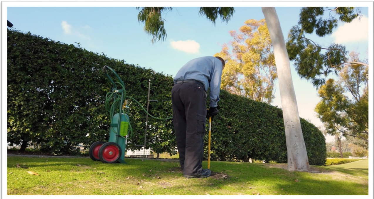
Example of a City pest control contractor using the ICI Carbon Dioxide

In 2021, work orders for gophers increased from 94 to 124 work requests. The organic products ContraPest and Terad3 were used to provide adequate control for rodents. Gopher X Extermination Machine and IGI Carbon Dioxide Liquid were used to control gophers. IGI Carbon Dioxide Liquid was the preference by the pest control contractor.