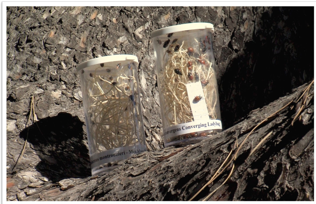
Example of beneficial insects about to be released in a City park.

Lastly, Landscape modification and proper sanitation continues to be an effective non-chemical approach to rodent management. By removing plants away from buildings, removing understory vegetation and using closed trashcan receptacles, rodent populations are manageable.