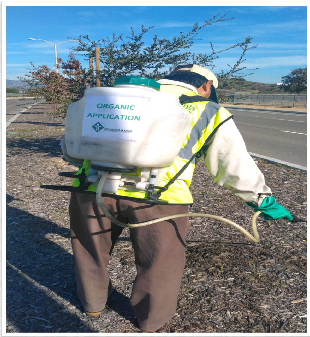
Example of an organic herbicide application by the City's landscape contractor.