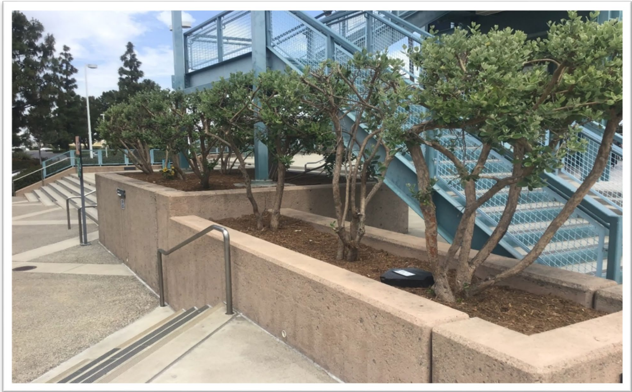
Example of raising shrub canopies to reduce covered habitat for rodents.