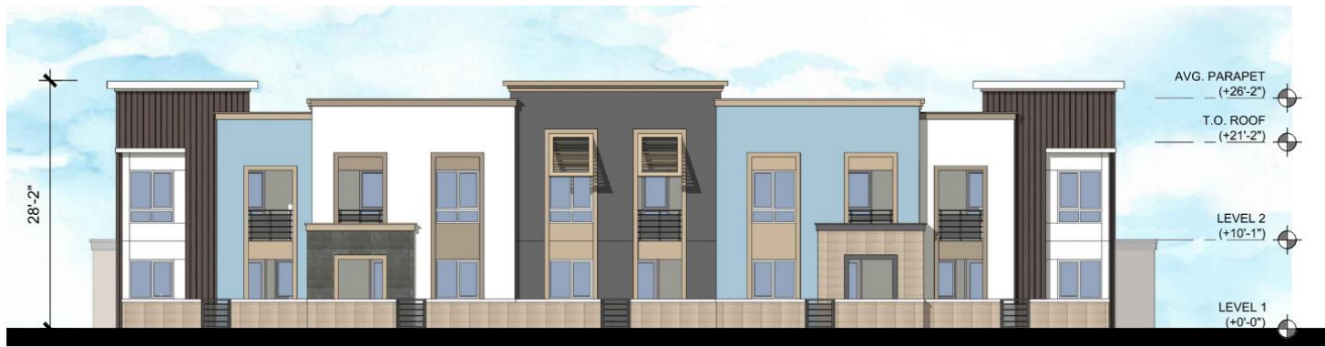
FRONT ELEVATION 1