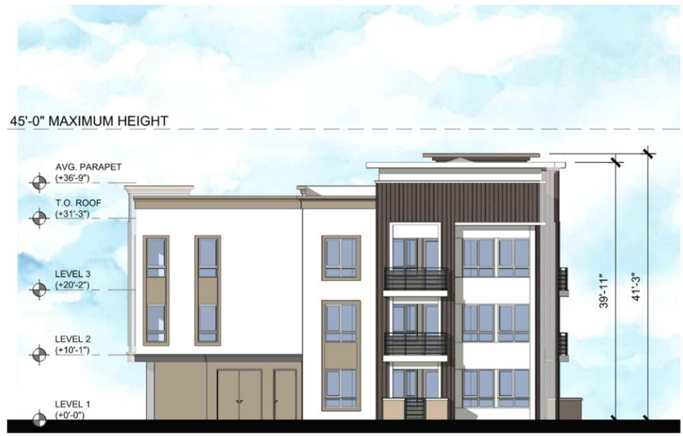
LEFT ELEVATION 2