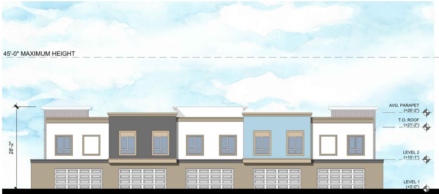
REAR ELEVATION 2