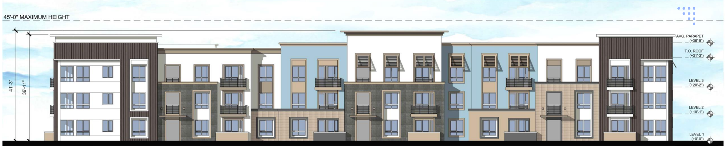
FRONT ELEVATION 1