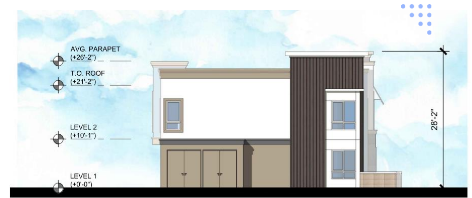
LEFT ELEVATION 2