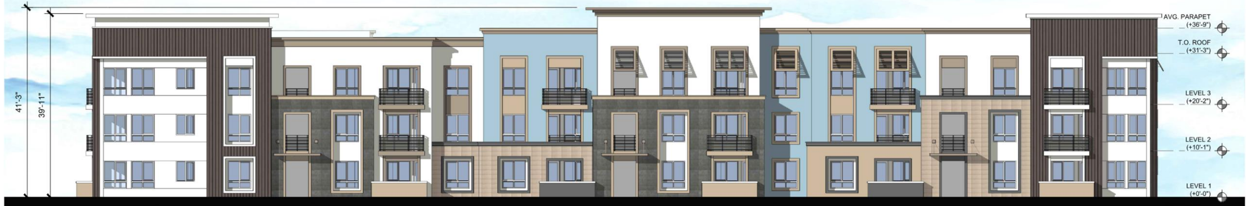
FRONT ELEVATION 1