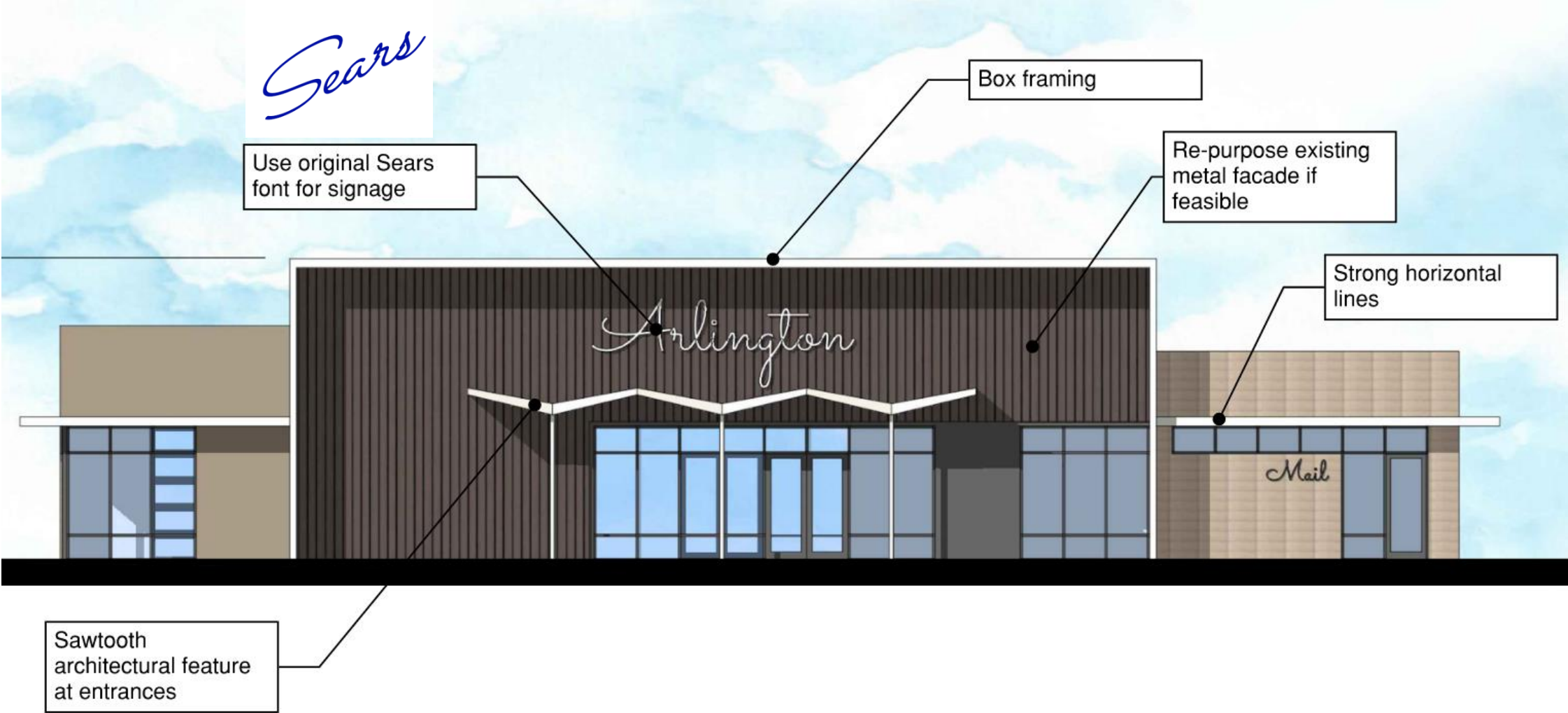
Clubhouse/Leasing Office Elevation