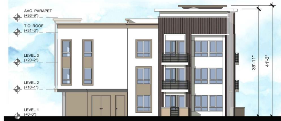
LEFT ELEVATION 2