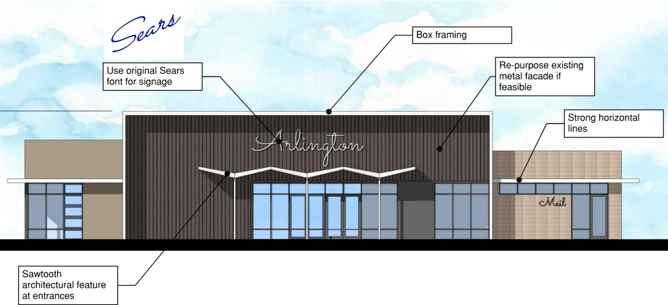
Clubhouse/Leasing Office Elevation