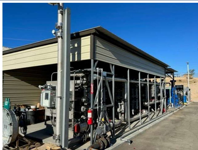
Victor Valley Wastewater Reclamation Authority RNG Facility