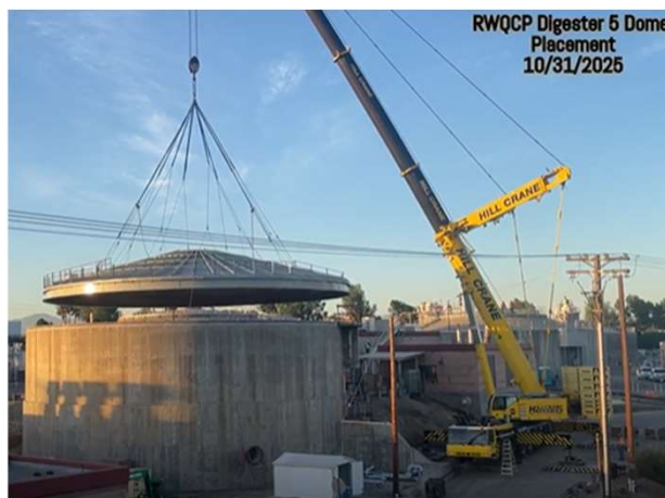
New Digester 5 Dome Placement