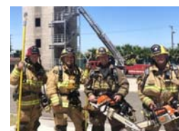
Training (5 FTE)