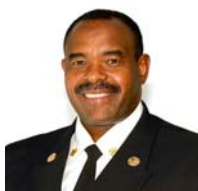
Administration (7 FTE)