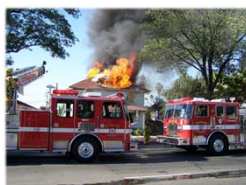
Operations (221 FTE)