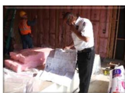
Prevention (15 FTE)