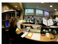
Special Services (7 FTE)