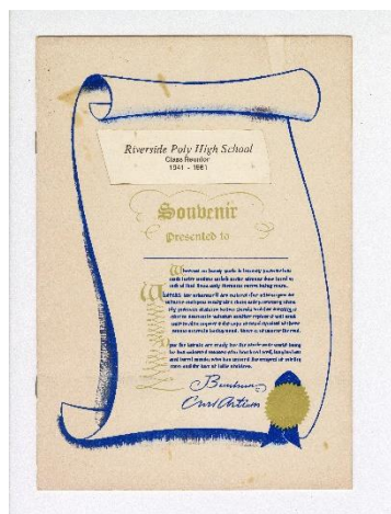
Souvenir, Poly High reunion 1941-1981