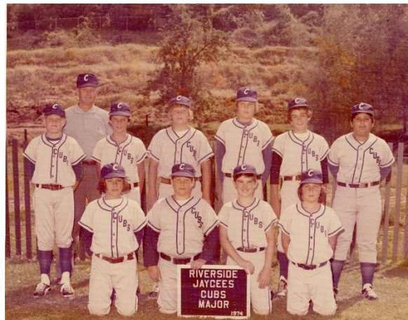
1974 team photo