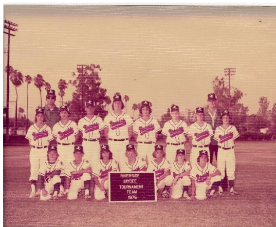
1976 Tournament photo