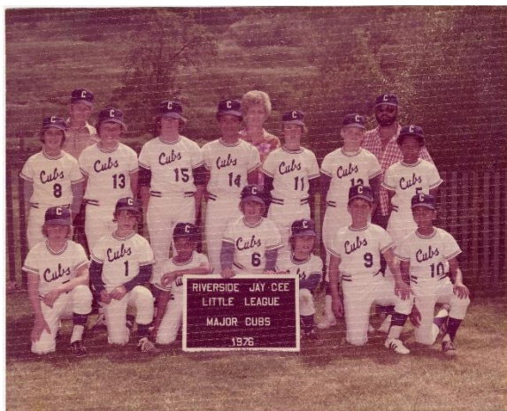
1876 team photo