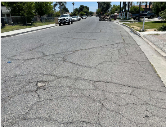
PAVEMENT RESURFACING ELLEN STREET