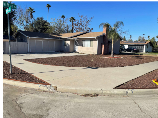
MISSING PEDESTRIAN RAMP DIANA AVE. AT HALSTED ST.