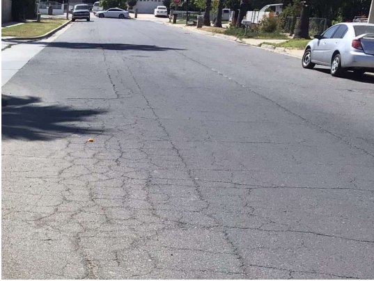
PAVEMENT RESURFACING DORLEN STREET