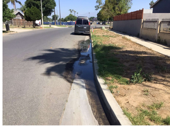
CONCRETE REPAIR DORLEN ST.