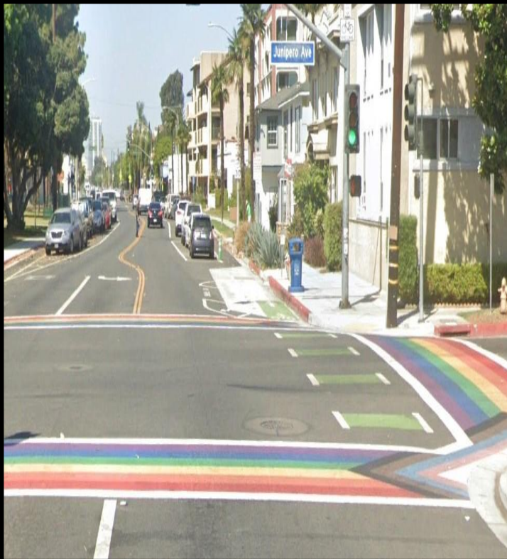
CITY OF LONG BEACH JUNIPERO AVE. & BROADWAY