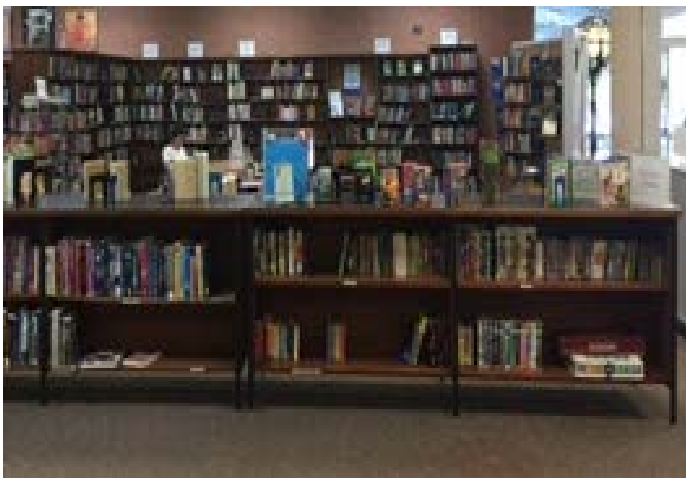
Current Friends of the Library Sale Area