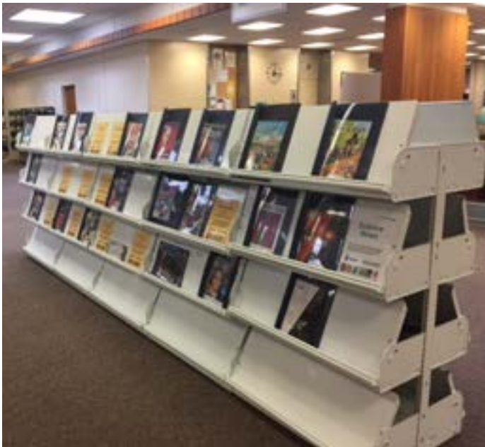
Current Magazine Shelving