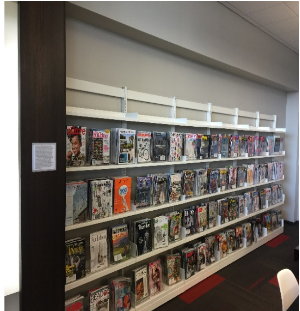
Proposed Magazine Wall Mount