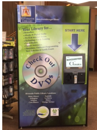
Proposed 750-Capacity DVD Unit