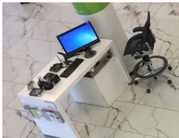
Proposed Customer Service Point