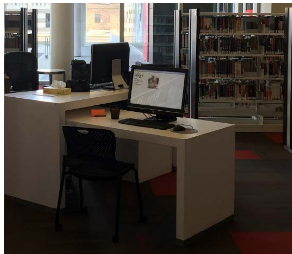
Proposed Staff Assistance Point