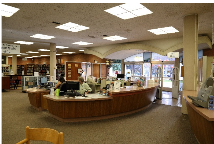
Current Customer Service Desk

The existing Main Library is 60,000 square feet. The new Main Library will offer approximately 35,000 square feet, with far more usable and flexible square footage than the existing library. This is accomplished in efficiencies gained through advancements in technology, a more flexible, functional building program and an improved service model. Examples include: