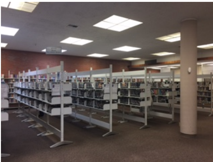
Current DVD/Media Shelving