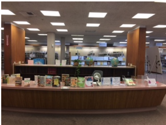
Current Reference Desk