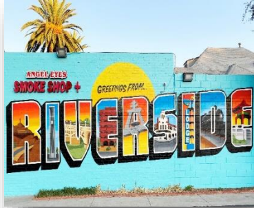
Arts & Cultural Affairs 6.00 FTE