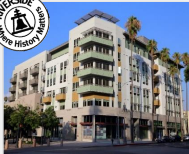
Planning 25.00 FTE