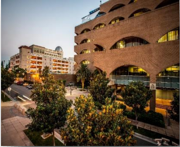
Administration 9.00 FTE