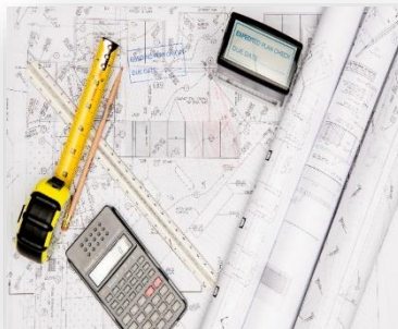
Building & Safety 22.00 FTE