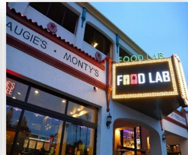
Successor Agency 3.00 FTE