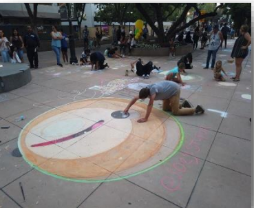
Neighborhood Engagement 4.00 FTE