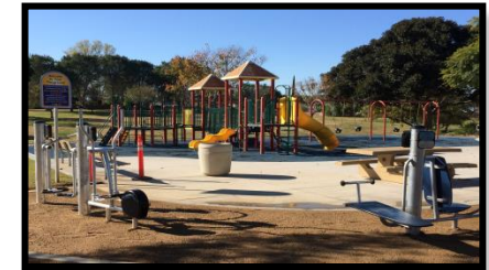
COMMUNITY DEVELOPMENT BLOCK GRANT