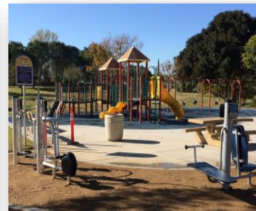
CDBG 4.00 FTE