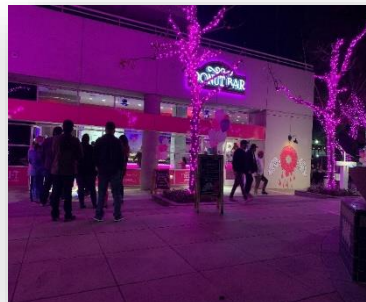
Real Property Services 5.00 FTE