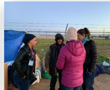
Homeless Solutions 5.00 FTE