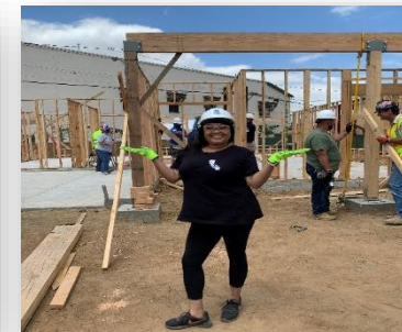
Housing Authority 8.00 FTE