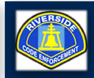
Code Enforcement 27.00 FTE