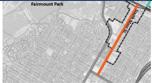
FIGURE 4-4: COMPLETE STREET KEY MAP