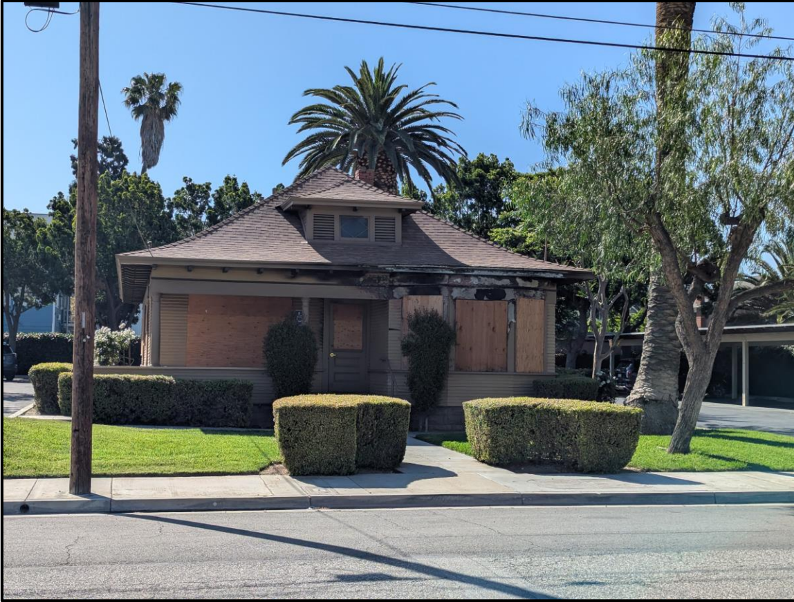
Structure of Merit Reassessment