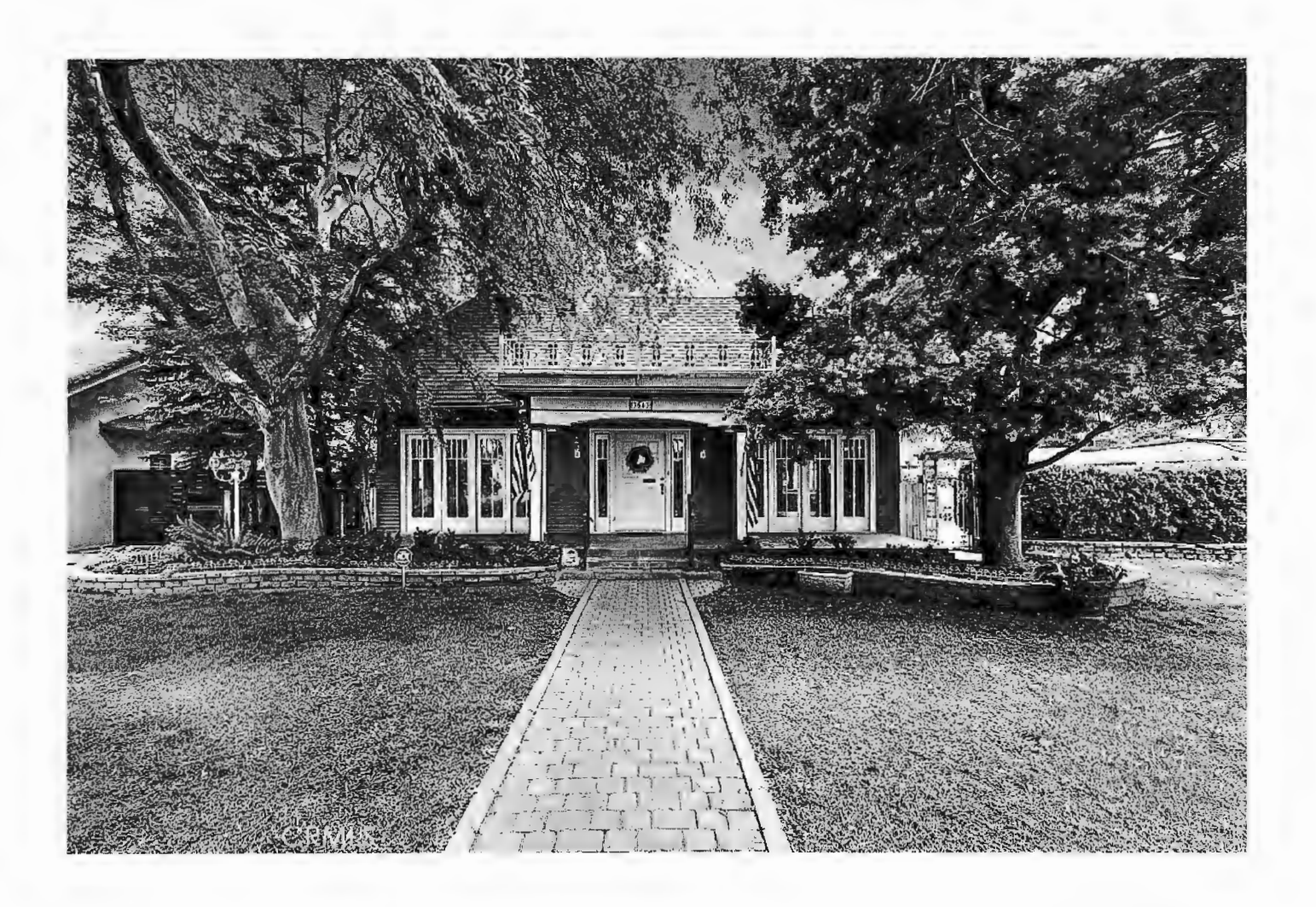
Exhibit "C" 3543 Larchwood Place