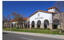
Neighborhood Public Services 52.00 FTE