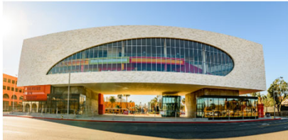
Administration 8.00 FTE