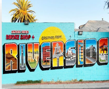
Arts & Cultural Affairs 6.00 FTE