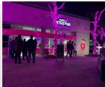
Real Property Services 5.00 FTE