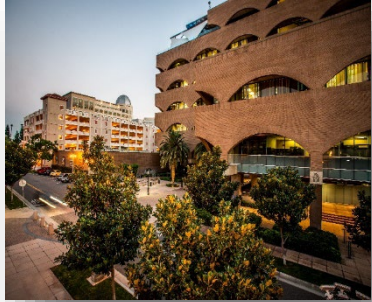
Administration 9.00 FTE