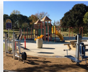
CDBG 4.00 FTE