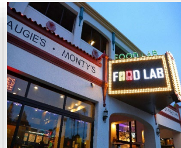
Successor Agency 3.00 FTE