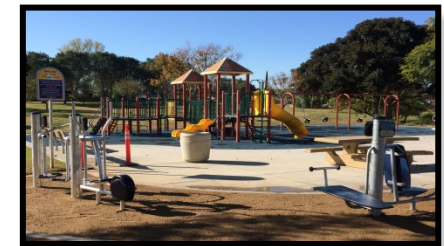
COMMUNITY DEVELOPMENT BLOCK GRANT