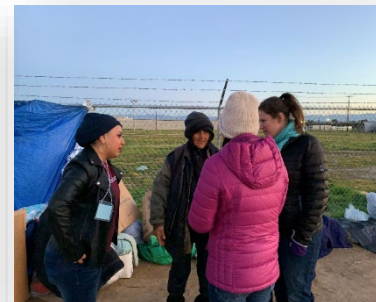
Homeless Solutions 5.00 FTE