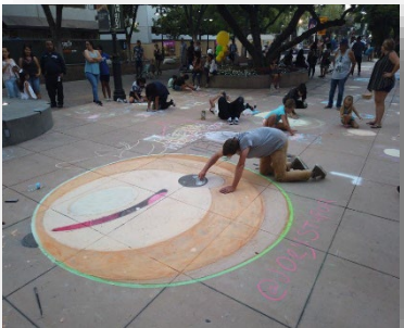
Neighborhood Engagement 4.00 FTE